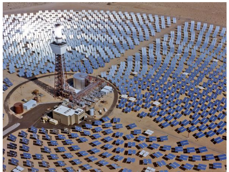
Solar One in the 1980s

Solar one operated until 1986 and was scrapped in 2009. Nothing exists at the site today and it currently is situated behind the newer solar power plants. Those newer power plants are currently operating. One of the plants is significant because it was the first one to utilize a system of parabolic mirrors that heated a special liquid that turns a turbine to spin a generator. This type of system is now widely used at many plants, including several around the Mojave Desert.