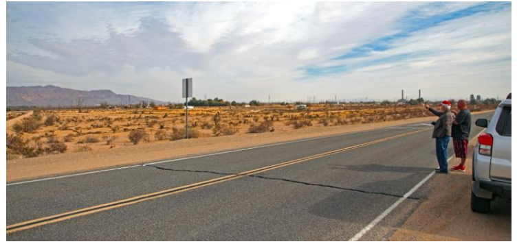
Remains of the Cool Water Ranch

The Cool Water Ranch existed for over a hundred years and was still boarding horses a few years ago.